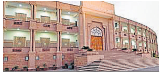
Rajasthan high court