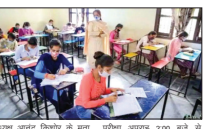
पटना। बिहार विद्यालय परीक्षा समिति द्वारा आयोजित मैट्रिक परीक्षा आज से शुरू होगी।