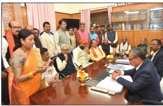
पटना। मुख्यमंत्री नीतीश कुमार राज्यसभा के उम्मीदवारों के लिए एनडीए उम्मीदवारों के नामांकन में शामिल होने के लिए विधानसभा सचिवालय में शामिल हुए।

राज्यसभा चुनाव के लिए एनडीए उम्मीदवारों के नामांकन में शामिल हुए मुख्यमंत्री नीतीश कुमार राज्यसभा सचिवालय में शामिल हुए।