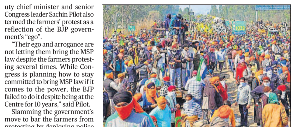
Farmers gather at the Punjab-Haryana Shambhu border.