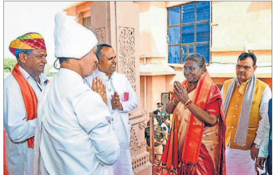
President Droupadi Murmu visits Hari Temple in Dungarpur with Assam governor Gulab Chand Kataria and Rajasthan chief minister Bhajan Lal Sharma.